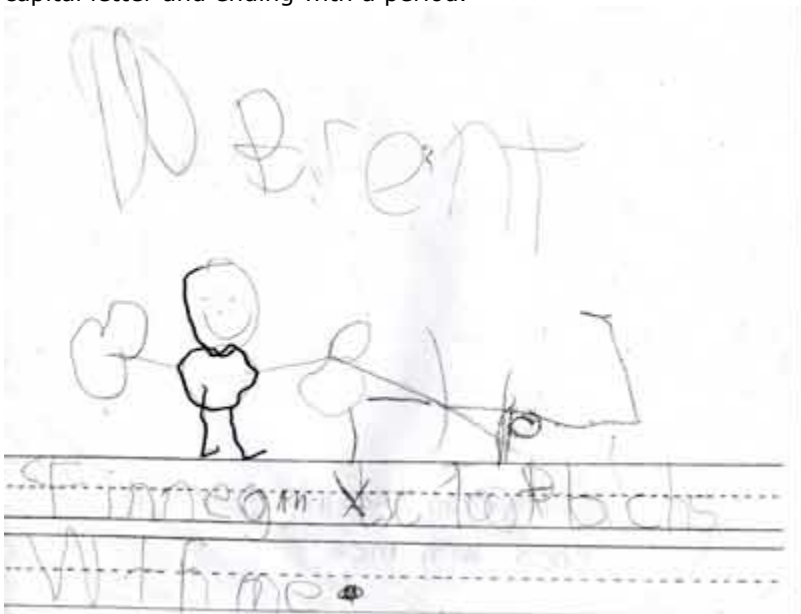
"Finnegan likes to play chess with me."