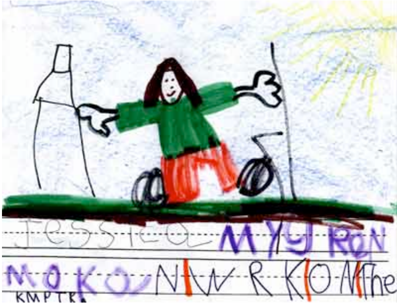
"My grandma can work on the computer."