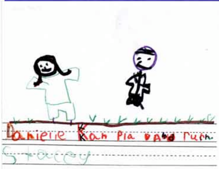
"Danielle can play and run."