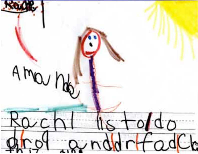
"Rachel likes to do jump rope and her favorite color is blue."