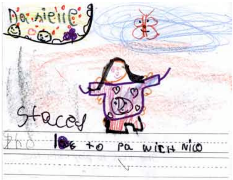
"She likes to play with Nico."