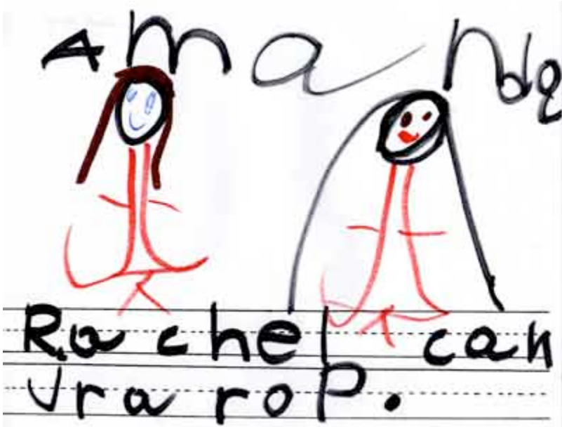
"Rachel can jump rope."